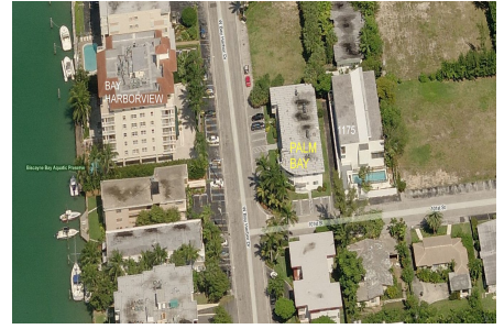
Built in 1956 - 12 units - 2 floors