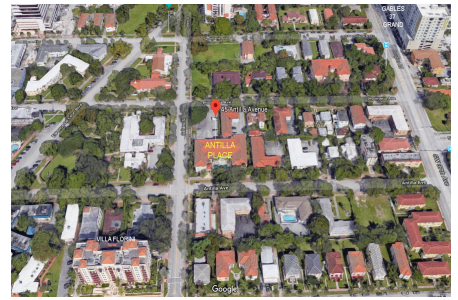
Built in 1960 - 30 units - 3 floors

Antilla Condo Assoc 45 Antilla Ave Apt 2I Coral Gables, FL 33134 Phone number (305) 460-6556