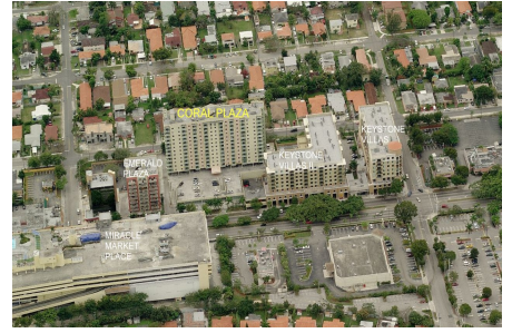
Built in 2002 - 180 units - 15 floors