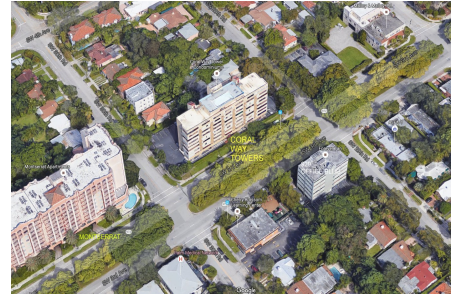
Built in 1974 - 54 units - 9 floors

Coral Way Tower Condominiums Address: 2950 SW 3rd Ave # 2D, Miami, FL 33129, Phone: +1 305-854-7829