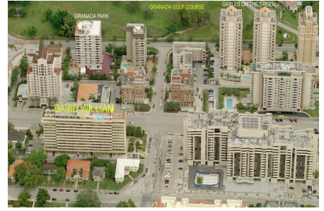
Built in 1963 - 195 units - 12 floors

David William Condominium Association 305-529-9050 & info@dwcondo.com property manager : manager@dwcondo.com http://www.dwcondo.com/