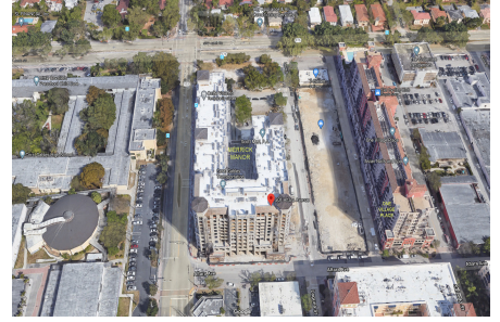
Built in 2019 - 227 units - 10 floors

Merrick Manor Address: 301 Altara Ave, Coral Gables, FL 33146 Phone: +1 305-779-6870 https://www.merrick-manor.com/