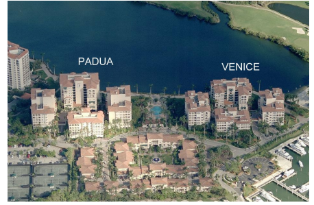
Built in 1995 - 54 units - 9 floors