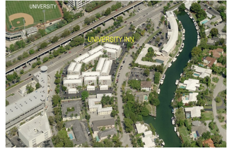
Built in 1990 - 146 units - 4 floors

University Inn Condominium Association (305) 661-6255