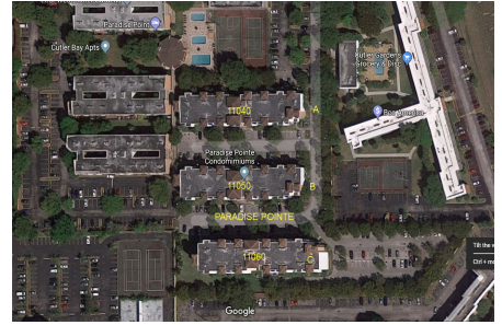
Built in 2005 - 190 units - 6 floors

Paradise Point Condominium Association 11050 Sw 196th Street Cutler Bay, FL 33157 Phone: (305) 253-0971 (305) 252-6637