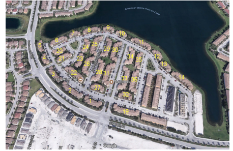
Built in 2008 - 317 units - 2 floors