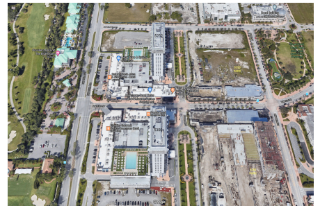
Built in 2016 - 203 units - 21 floors