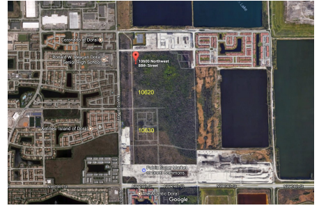
Built in 2015 - 111 units - 3 floors