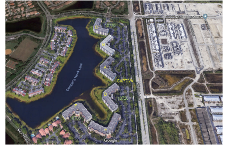
Built in 2001 - 70 units - 5 floors

Doral Isles Community Association Address: 6450 NW 110th Ave, Doral, FL 33178, Phone: +1 305-436-0912