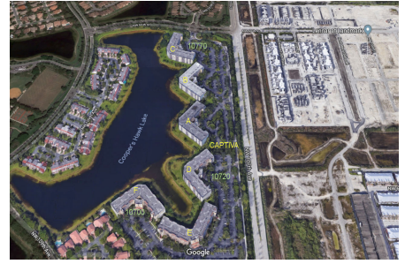
Built in 2002 - 70 units - 5 floors

Doral Isles Community Association Address: 6450 NW 110th Ave, Doral, FL 33178, Phone: +1 305-436-091