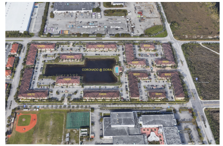
Built in 2007/2010 - 328 units - 3 floors

Number of units: 328 Number of active listings for rent: 6 Number of active listings for sale: 5 Building inventory for sale: 1% Number of sales over the last 12 months: 10 Number of sales over the last 6 months: 4 Number of sales over the last 3 months: 1