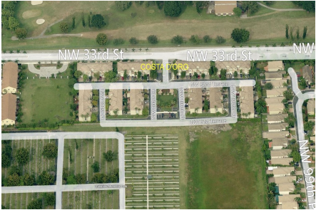
Built in 1998 - 52 units - 2 floors