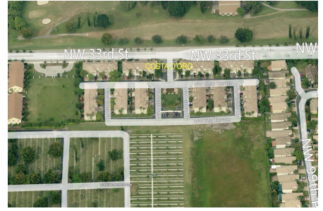
Built in 1998 - 52 units - 2 floors