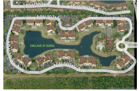
built in 1998 - 258 units - 3 floors

Enclave At Doral Master Association 4300 NW 107th Ave Doral, FL 33178 (305) 477-7870