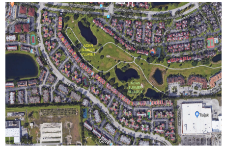
Built in 1984 - 146 units - 2 floors

Indian Summer Village II Condo Association Inc 415 West Park Drive Miami, FL 33172 Phone: (305) 496-0182