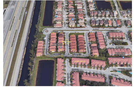
Built in 2007 - 38 units - 2 floors

Isla Margarita at Doral Homeowners Association 5975 Sunset Drive # 400 South Miami, FL 33143 (305) 567-0305