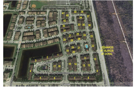
Built in 2005 - 340 units - 2 floors