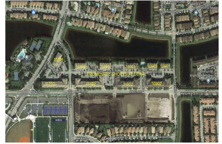
Built in 2006 - 240 units - 2 floors

Promenade Shores @ Doral Condominium Association, Inc. 12350 SW 132 Ct Ste 114 Miami