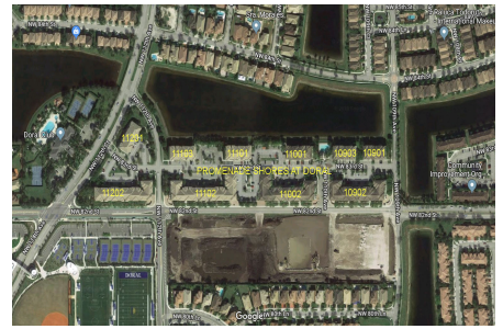
Built in 2006 - 240 units - 2 floors

Promenade Shores @ Doral Condominium Association, Inc. 12350 SW 132 Ct Ste 114 Miami