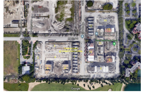
Built in 2015 - 85 units - 3 floors

Downtown Doral Townhomes Homeowners Association, Inc 8500 NW 52nd Street Doral, FL 33166 Phone: (305) 856-2600 http://downtowndoral.com/townhomes/