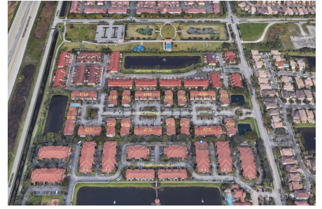
Built in 1999 - 124 units - 2 floors

Number of units: 162 Number of active listings for rent: 0 Number of active listings for sale: 0 Building inventory for sale: Number of sales over the last 12 months: 0% Number of sales over the last 6 months: 1 Number of sales over the last 3 months: 0