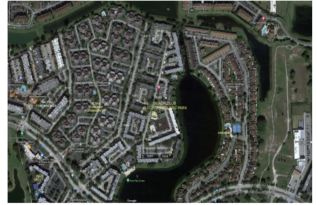
Built in 1972 - 710 units - 4 floors

The Beach Club @Fontainebleau Park Condominium Association, Inc. 9361 Fontainebleau Blvd Miami, FL 33172-5603 (305) 553-9292 https://thebeachclubatfontainebleaupark.communitysite.com/