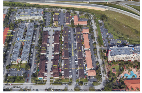
Built in 2001 - 67 units - 2 floors