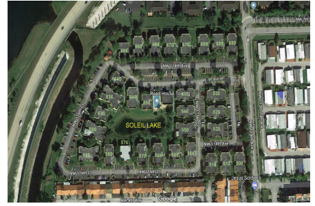
Built in 1986 - 240 units - 2 floors