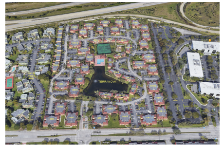
Built in 1983/1989 - 324 units - 2 floors

Terranova Condominium Association Address: 8600 NW 17th St #145, Miami, FL 33126 Phone: +1 305-221-4826