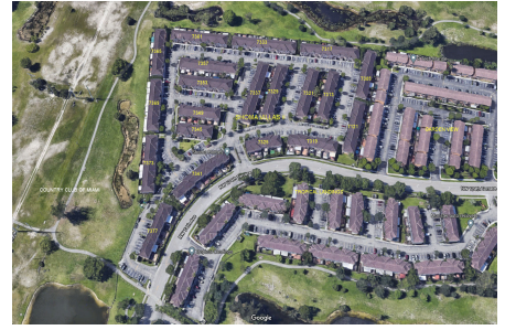
Built in 2004 - 159 units - 2 floors

Shoma Villas II at Country Club of Miami A Condominium Association Managed by Exclusive Property Management Group (786) 585-3801 https://www.shomavillas2.com/