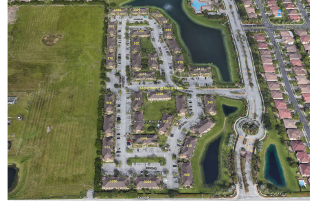
Built in 2005 - 240 units - 2 floors

Monterey at Malibu Bay Address: 920 NE 33rd Terrace, Homestead, FL 33033