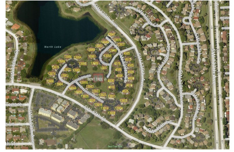
Built in 1976 - 192 units - 2 floors

Bent Tree Center Assoc Inc 13831 Sw 59th St Ste 106 Miami, FL 33183-1150 (305) 380-9020