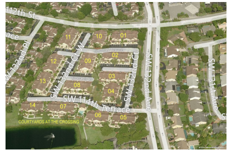
Built in 1984 - 130 units - 2 floors

The Crossings Home Owners Association Inc. Address: 11578 SW 132 Ave Miami, FL 33186 Office: (305)-387-0436 Fax: (305) 387-0245 http://www.thecrossingshoa.net/home.asp