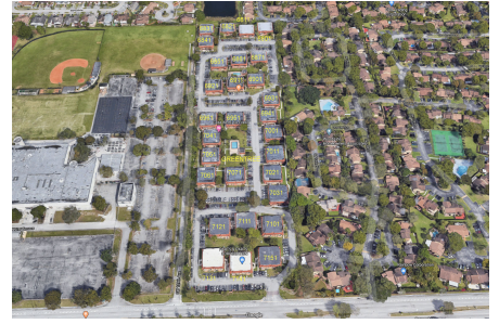
Built in 1983/1993 - 232 units - 2 floors

Greentree Condominium Association, Inc 12485 SW 137th Avenue # 309 Miami, FL 33186 (305) 251-2234