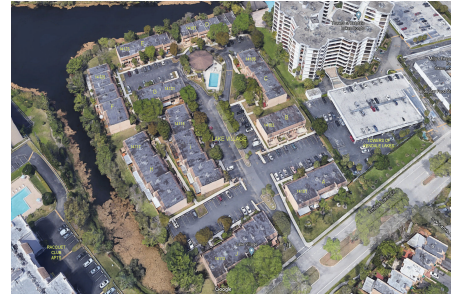
Built in 1973 - 65 units - 2 floors

Lake Village Address: 14125 SW 66th St, Miami, FL 33183