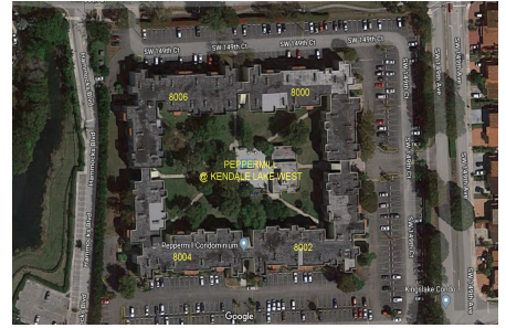
Built in 1980 - 236 units - 4 floors

Peppermill at Kendale Lake West 8000 SW 149th Ave Miami, FL 33193 (786) 536-6081