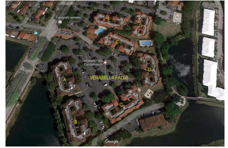
Built in 1984 - 449 units - 4 floors

Verabella Falls Condominium Association 7100 Sw 99th Avenue # 102 Miami, FL 33173 Phone: (305) 380-1512