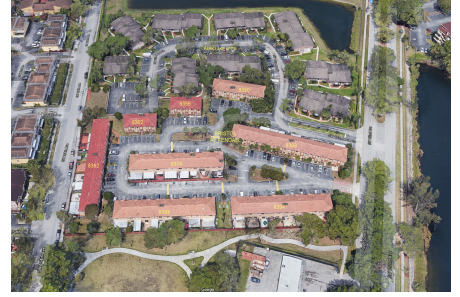
Built in 1996/2000 - 54 units - 2 floors