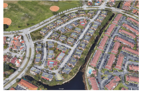
Built in 1989 - 224 units - 2 floors