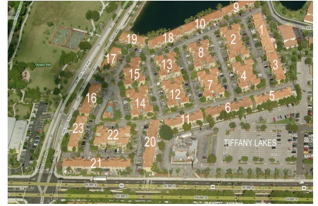
Built in 1996 - 234 units - 2 floors

TIFFANY LAKES CONDO INC 900 W 49TH ST, STE 220 HIALEAH, FL 33012 (305) 821-7668