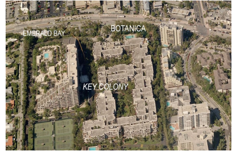
Built in 1981 - 288 units - 4 floors

Key Colony Number Four Condominium Association Inc Botanica (305) 361-3662