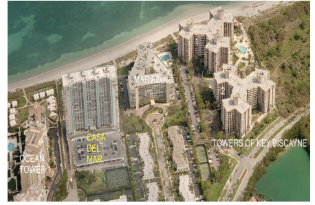
Built in 1971 - 234 units - 27 floors

Casa Del Mar Condo Association Inc (305) 361-9121