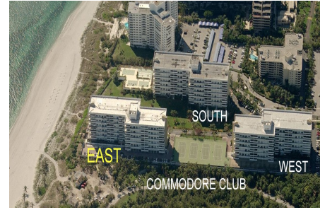
Built in 1971 - 185 units - 12 floors

Commodore Club Number One condominium (305) 361-1157 & (305) 361-1656