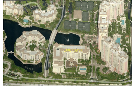
Built in 2002 - 75 units - 7 floors