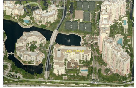
Built in 2002 - 75 units - 7 floors

http://www.oceanclubkeybiscayne.org/Default.aspx?p=DynamicModule&pageid=301066&ssid=185