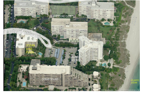
Built in 1981 - 89 units - 9 floors

Ocean Lane Plaza Associates Incorporated 170 Ocean Lane Dr, Key Biscayne, FL 33149 (305) 365-1100