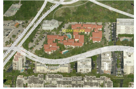
Built in 1982 - 140 units - 4 floors

Ocean Village Condominium Association Inc, 101 Ocean Lane Drive Key Biscayne, FL 33149 Phone: (305) 361-3416