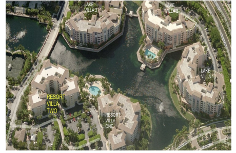
Built in 1997 - 46 units - 6 floors

Ocean Club Community Association, Inc 753 Crandon Blvd Key Biscayne FL33149 (305) 361-336 (305)-365-6085 http://www.oceanclubkeybiscayne.org/Default.aspx?p=DynamicModule&pageid=301066&s