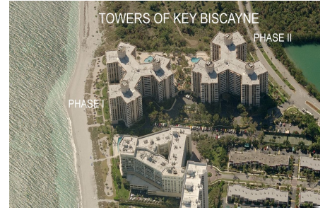
Built in 1972 - 276 units (538 with Phase 1) - 16 floors

The Towers of Key Biscayne Condominium Association (305) 361-9114 http://www.tkbonline.com/contact-us