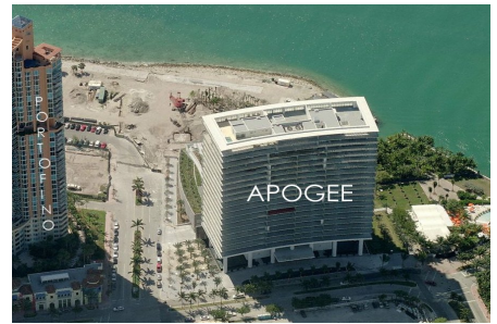
Built in 2008 - 67 units - 23 floors

Apogee Condominium Association Inc 305-674-1163. http://www.apogeecondomiami.com/