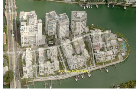
Built in 2005 - 46 units - 4 floors

Aqua Allison Island Associations aquaadmin@aquaassociation.net Sub-association - Aqua Island Homes Association aquaassistant@aquaassociation.net http://www.aqua.net/index.php