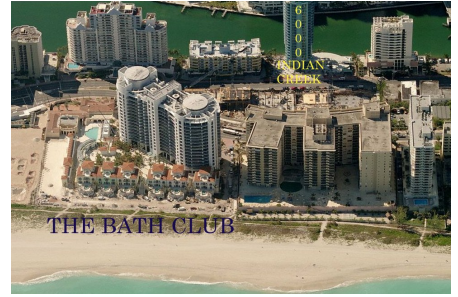
Built in 2005 - 117 units - 20 floors

Residence at the Bath Club association 305-861-1470 office 305.867.5938 info@thebathclub.com http://www.thebathclub.com/cms/index.php