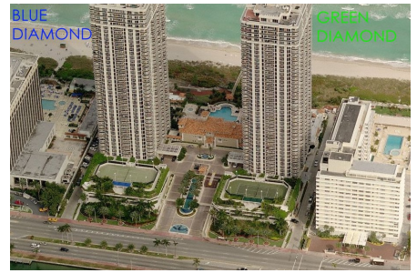
Built in 2000 - 315 units - 44 floors

Blue Diamond condominium Association, inc (305) 672-9910 & 305-672-4779 http://bluegreendiamondcondos.com/blue